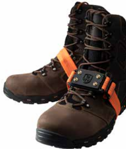
CLEATS CAN BE EASILY FLIPPED TO THE TOP OF THE BOOT WHEN MOVING INDOORS